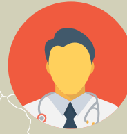
HEALTH & AWARENESS