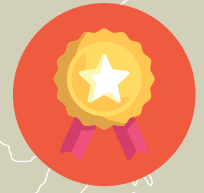
QUALITY & ACCOUNTABILITY